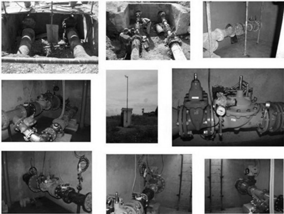
Fig. 2 Control shaft no. 12

After consultation with the provider of distribution system three districts D_1 , D_2 and E were selected. These districts are marked with a red line in figure 1. For the purpose of measurement it was necessary to reconstruct the shaft no. 12 because of installing the pressure reducing valve (see the figure 2).